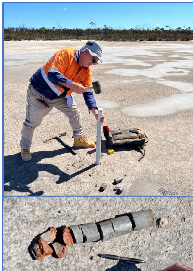
Figure 2. Lake Hope showing the push tube sampling method used to drill out the resource and an example of the lake clay from the push tube showing excellent sample recovery.

About 60% of the Measured Resource lies within West Lake, over which Impact recently pegged a Mining Lease Application (ASX Release August 12th, 2024). When required, further low-cost push-tube sampling of the lake can significantly increase the size of the measured resource (Figure 2).